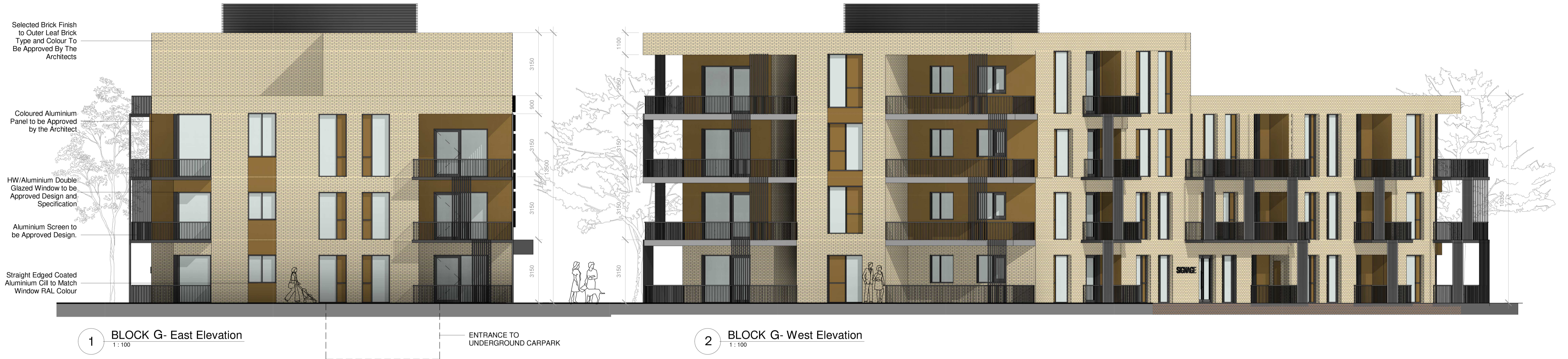
1 BLOCK G- East Elevation 1:100